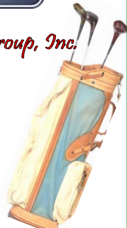
Photo Packages of you and/or your team will be available.